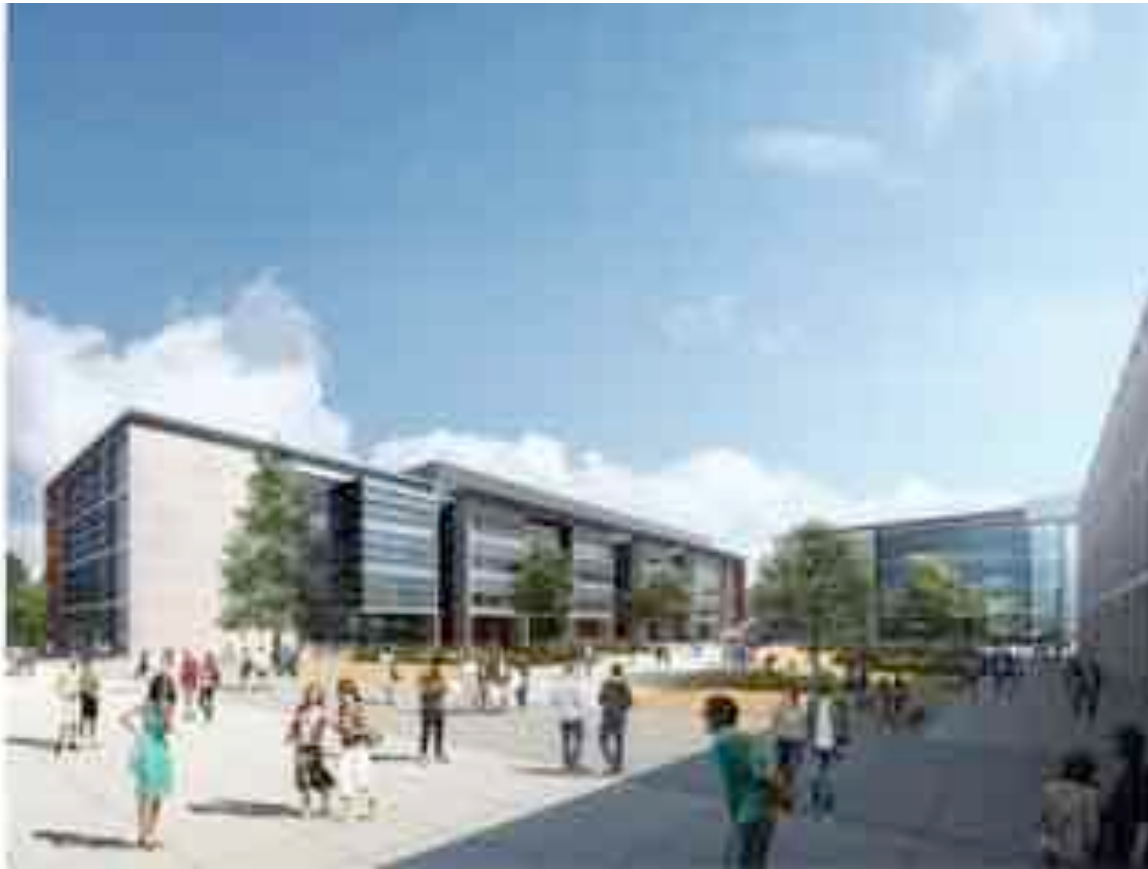
Northeast view of low-water landscaped Academic Quad

New faculty offices, classrooms and research labs are arranged around new quadrangle adjacent to the existing campus