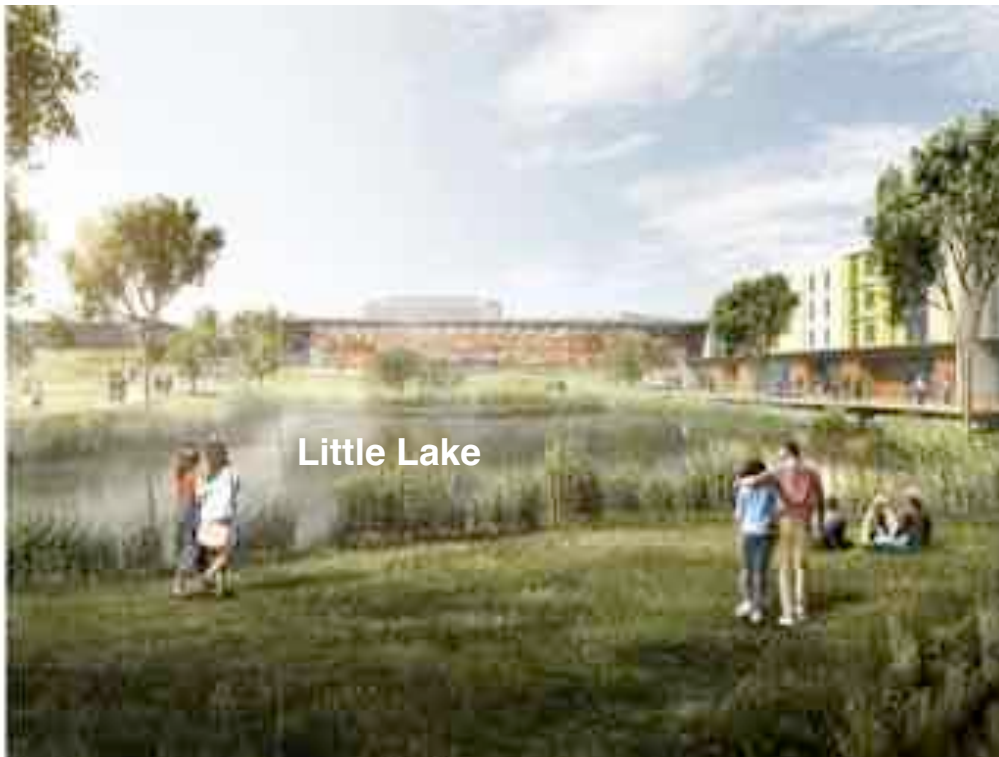
Northeast view across Little Lake