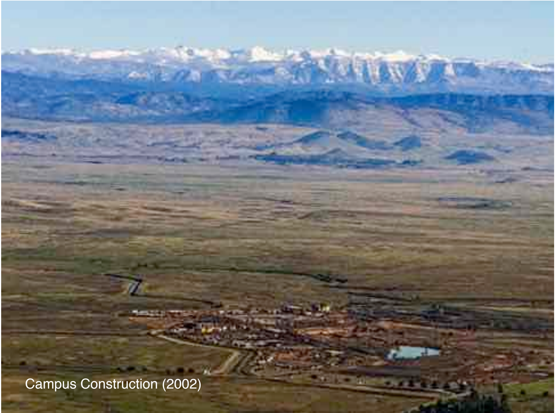
Campus Construction (2002)