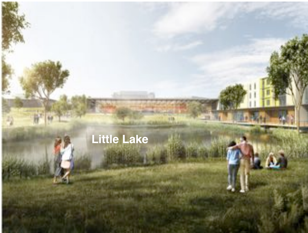
Northeast view across Little Lake