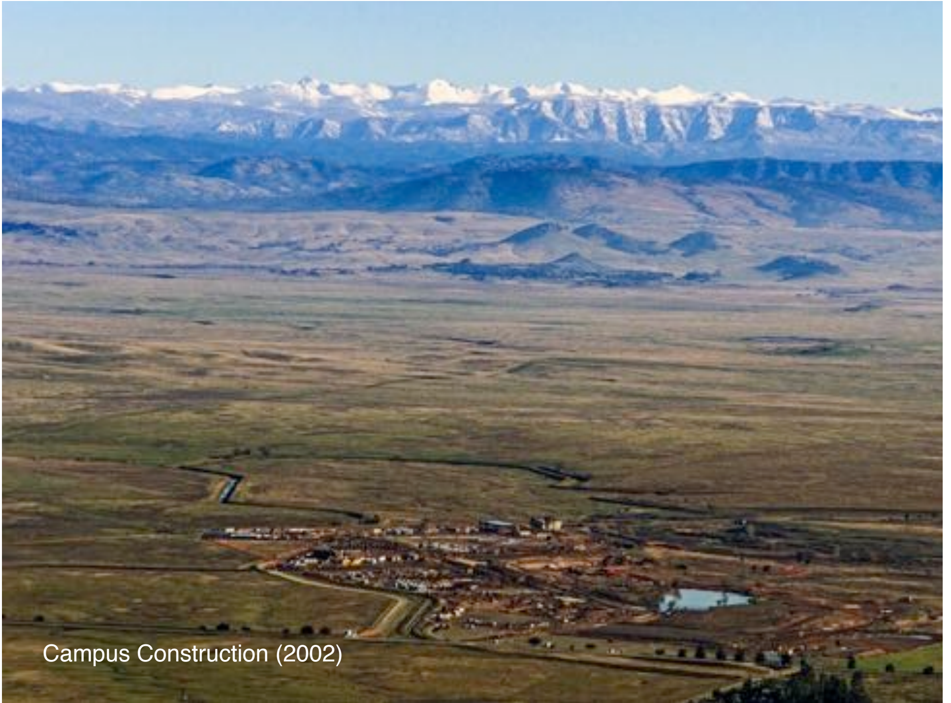
Campus Construction (2002)