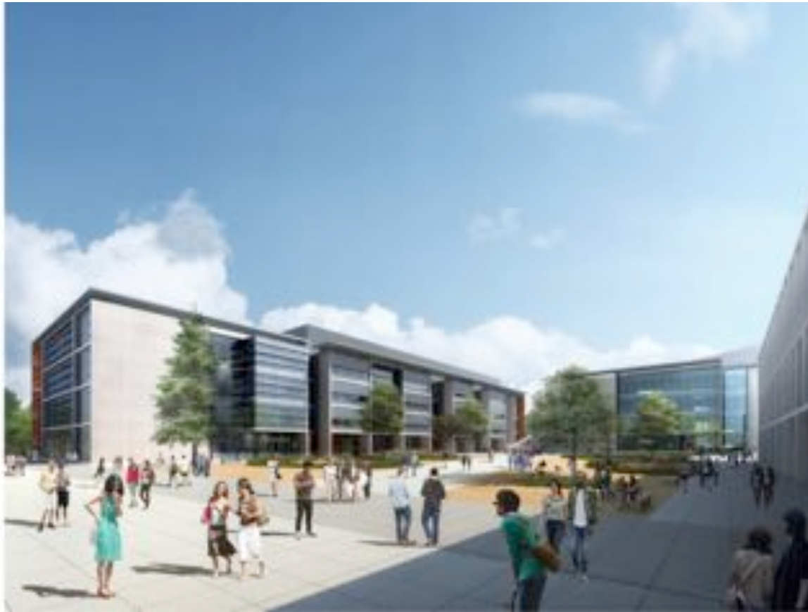
Northeast view of low-water landscaped Academic Quad

New faculty offices, classrooms and research labs are arranged around new quadrangle adjacent to the existing campus