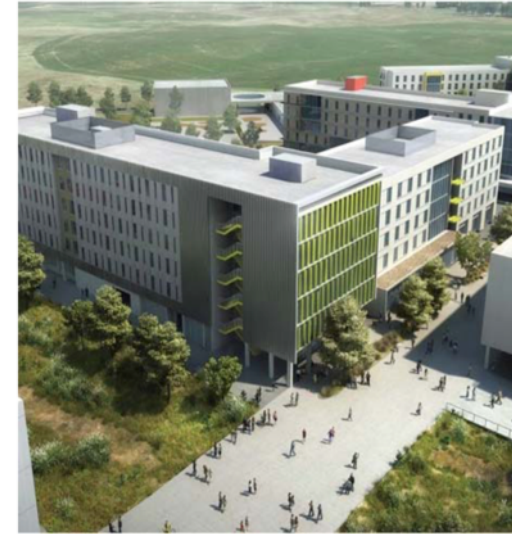
Housing 1B 6 floors, 164,000 GSF LEED Gold