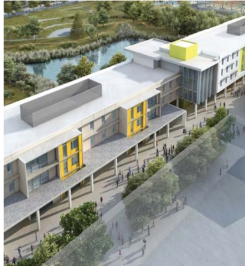
Housing 1A/3B Four floors, 100,000 GSF LEED Gold