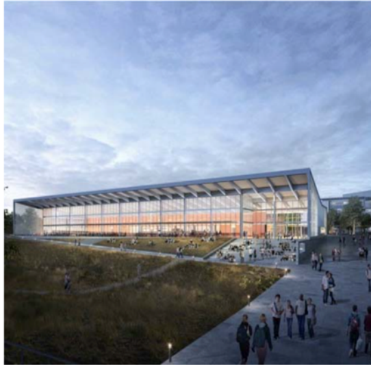
Central Dining Facility 600-seats, 37,000 GSF LEED Gold

The first three buildings are scheduled to be occupationally ready prior to Fall 2018 academic year Design work is also progressing for second and final deliveries